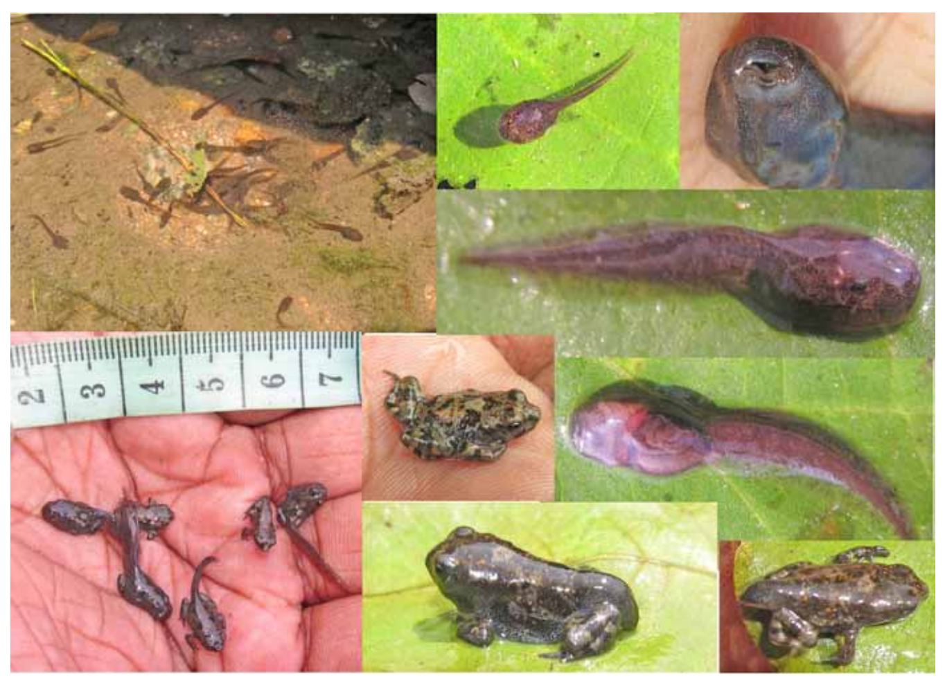
FIG. 1. Tadpoles of Günther's toad Duttaphrynus hololius (Günther, 1876) (clockwise) showing different stages of its ontogeny. Renacuajo del sapo de Günther, Duttaphrynus hololius (Günther, 1876), mostrando (en el sentido de las agujas del reloj) diferentes estadios de su ontogenia.

made on live tadpoles using a magnifying hand-lens and were measured with a vernier caliper. No specimens were collected. Puddles were measured for their length, width or diameter in case circular and water depth in cm with a standard measuring tape.