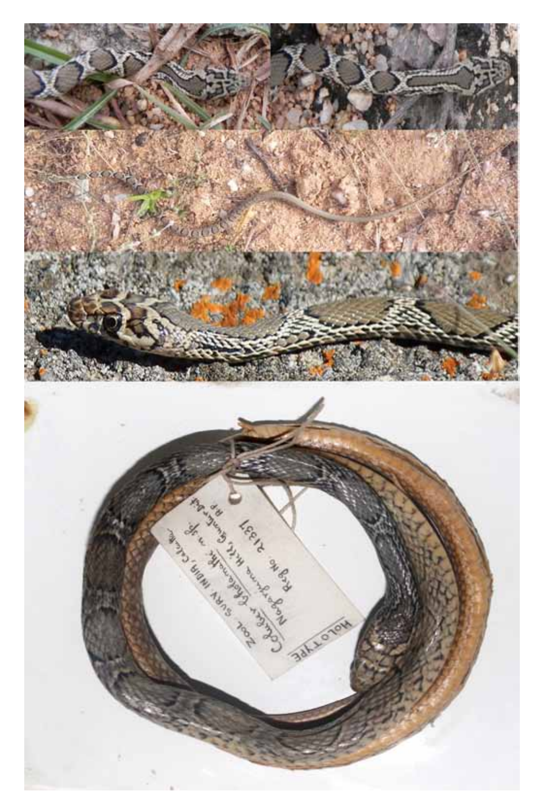
FIG. 1. Living, uncollected Coluber bholanathi (top left to bottom right) – dorsal views of head and neck of the juvenile from Devarakonda, entire profile of the juvenile from Devarakonda, lateral view of head and neck of adult from Thally; entire dorsal profile of the holotype ZSIC 21337.

Coluber bholanathi vivo, no capturado (parte superior izquierda hasta parte inferior derecha) – vista dorsal de cabeza y cuello del juvenil de Devarakonda, perfil entero del juvenil de Devarakonda, vista lateral de la cabeza y el cuello de adulto de Thally; perfil dorsal entero del holotipo ZSIC 21337.